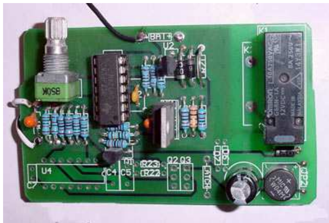
Fig 2. The printed circuit board of the thermostat is double-sided and has insulating solder masks to maximize the circuit safety and reliability. The 240V part contains only 2 pins and they are well insulated from the rest of the circuit.

During the system operation, the nominal 8.4V NiMh battery voltage varies between 9.2V and 9.4V, so that in practical terms the battery remains fully charged and hence can operate for many years.