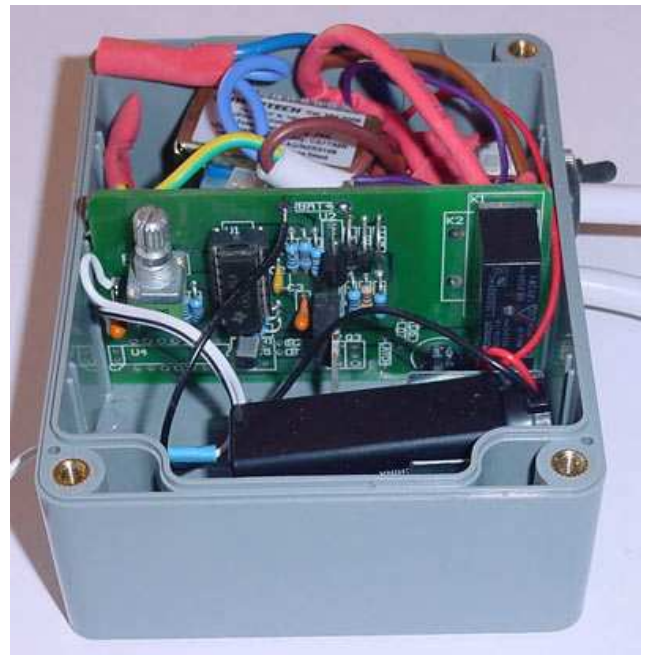
Fig 3. Inside the thermostat. The thermostat enclosure is waterproof. Top: transformer surrounded by soldered and double-insulated wires. Bottom: the 9V NiMh battery. Cables are intentionally left longer so that the assembled pcb can be removed for inspection without disconnecting it from any part of the circuit.

thermal fuse and the magnetizing current <20\text{mA} . Since the battery charger section (transformer TR1 and LM317 regulator) only work 1-2 minutes per hour, their optimization was not attempted.