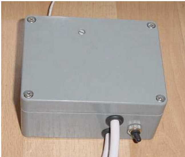
Fig 4. The thermostat at work. Bottom wires are 240V in-out wires entering the enclosure via rubber grommets. The end of the top wire connects to thermistor R1. Switch SW1 is equipped with a waterproof boot. The potentiometer shaft end is accessible for easy temperature adjustment. A bit of a good tape or a drop of silicone can be used to cover the potentiometer shaft if the full waterproofing is required.

I have doubts if this issue requires attention, because my view is that if the power goes down for many hours, the content of any fridge, no matter how advanced, will need a very careful inspection and manual intervention. When the power is restored, my system will require switching to the “SW1 up” mode for a day or so, so that the battery becomes fully recharged.