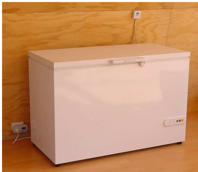
Fig 2. Fully installed chest fridge with thermostat on the wall. Note energy measuring gadget at the bottom left.