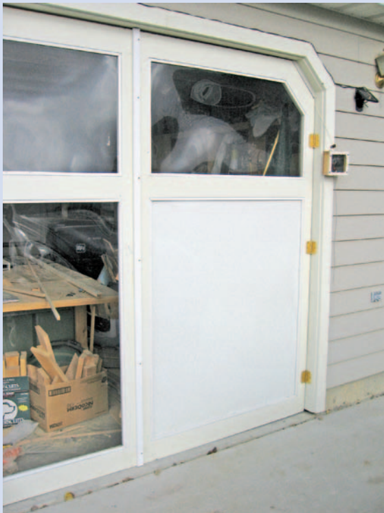
To prevent your shop from overheating in the summer, install 1/8-inch, white hardboard panels on the inside of the lower door panels.

Once you are satisfied with the fit, use three door hinges to attach each door to the existing garage door frame and new post. As a general rule, use one hinge for every 30 inches of door or fraction thereof. I used ordinary door hinges, which have worked fine, but heavier hinges could be used if the doors get a lot of use.