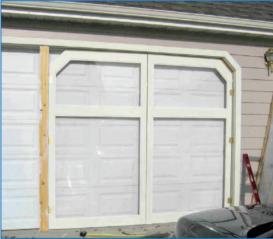
Two of the four “solar” doors installed on the right side of the center column (not yet finished). The original garage door can still close, providing some nighttime insulation.

The column is made from three 2 by 4s nailed together. The top and bottom of the column are attached to metal plates that are lag-screwed to the concrete floor and the upper door frame. To restore the full-width opening of the garage, the column can be removed by taking out the lag screws. To mask the ganged 2 by 4s and match the existing door frame, you can add trim pieces to the outside of the column.