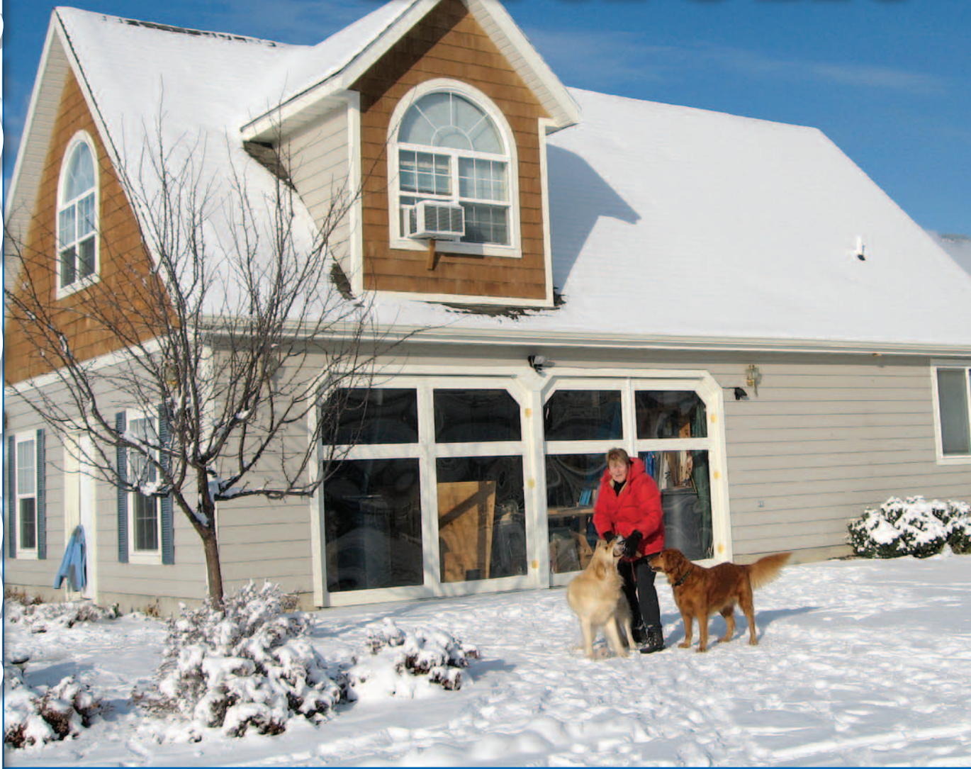
Custom-built glazed doors can turn your garage into a sun-warmed winter workshop.