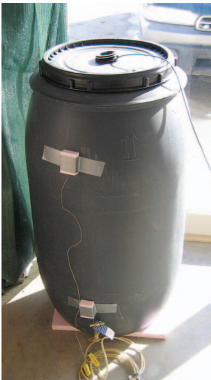
Water barrels set inside the solar doors act as thermal mass, helping minimize temperature swings from day to night. (Here, temperature sensors monitor heat gain.)

Occasionally, I hear comments that passive solar thermal heating can't possibly work when it's really cold out—wrong! Since I added the glazed doors, the temperatures in my workshop are usually in the high 60s or low 70s—without additional heating. I monitored the temperatures inside the shop during a period of cold, clear weather. The ambient temperature dropped to 20°F below zero, but the daytime shop temperature—just relying on the solar collector for heating—still reached 70°F (see graph). So far, the shop has never been too cold to work in.