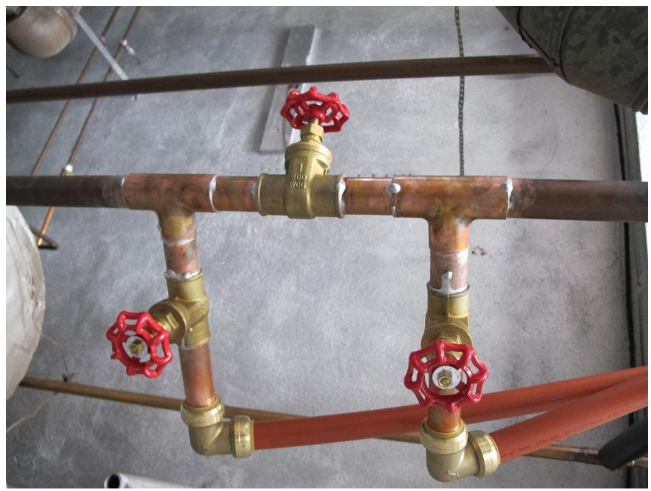
The buildings 1" copper cold water inlet. Bottom valves, Sharkbite elbows and PEX connect to the heat exchanger in the tank.