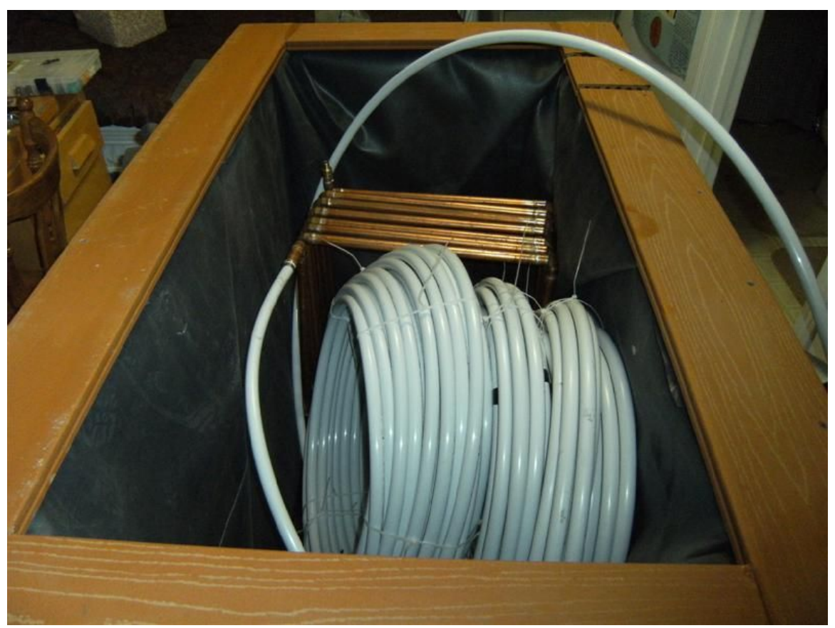
Partially connected PEX and copper combination heat exchanger

The major challenge was getting the tank into position. I was going to take out some of the studs to fit it in from the basement side, but I hadn't noticed that the main gas line and water line were also in the way. It looked like the only way in was through the wall of the bedroom, which took a bit of a family sales pitch. The family is quite supportive of the whole project, so they went along with the idea. My wife's comment was "just don't drywall it in, because you know you'll have to get in there again!" So I am putting a piece of plywood there for easy access.