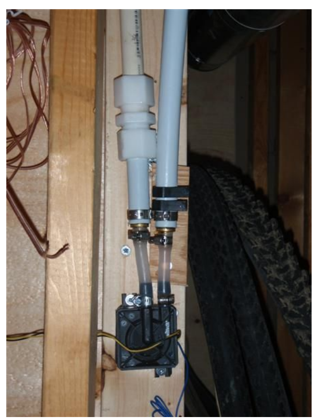
Pump (Swiftech MCP355) and 3/8" to 3/4" piping arrangement

Once I filled the tank and primed the pump, it was ready for commissioning. Some sputtering and gurgling, then 50 seconds later, water back to the tank! I ended up with 9