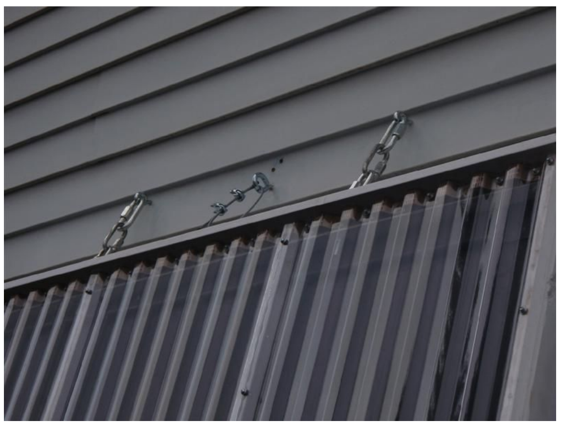
Hangers use screw eyes and quick links

To get the angle and provide additional support, I put 2X4 frames with hinges on the backs of the collectors. Once the collectors were hanging, I attached the frames to the house studs with long lag screws. I decided to go with a 75 degree angle due to the northern latitude (55 degrees here). Changing this wouldn't be hard.