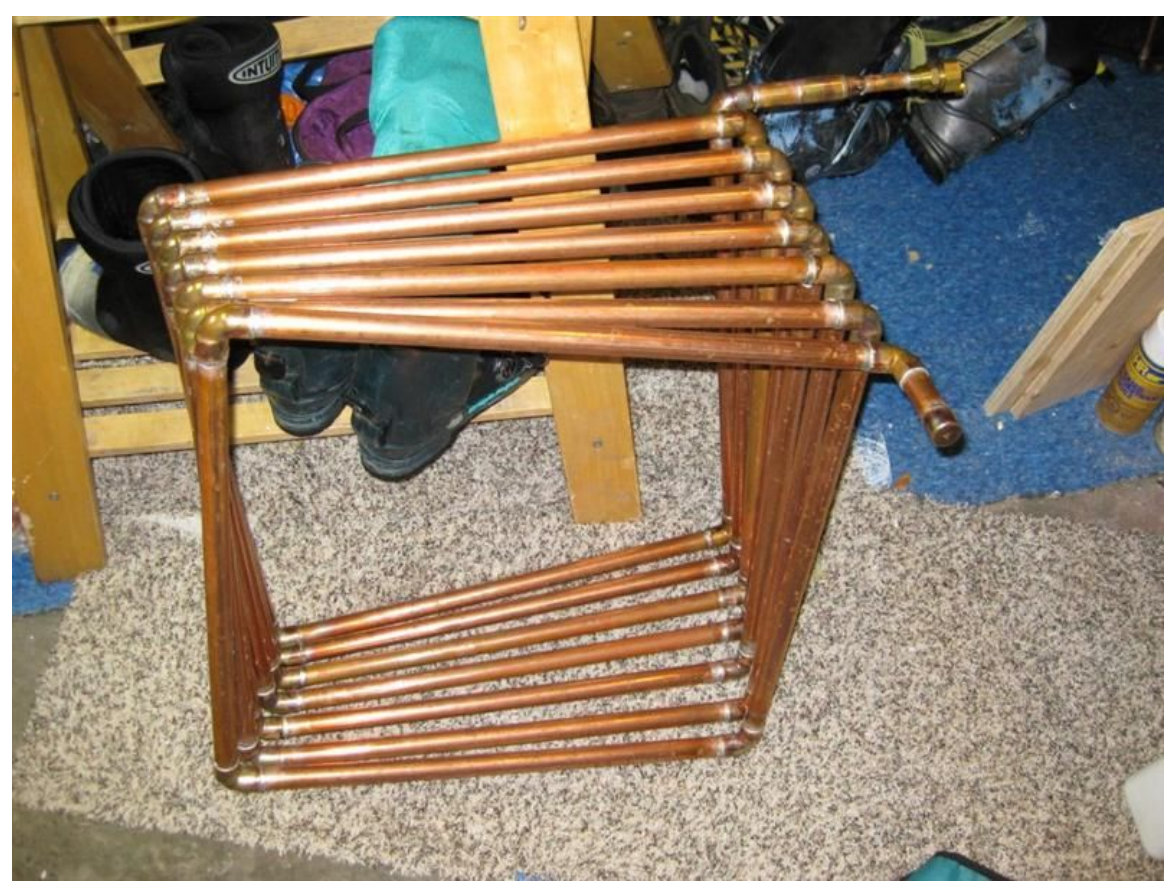
Copper part of heat exchanger

The price of copper slowly came down from the stratosphere this winter, so I shopped around for four 12 foot lengths of ¾" type M copper pipe, and a whole lot of elbows. I cut the pipe into 20" lengths and learned how to solder copper pipe (brand new to me). I made a square spiral with ~30 elbows. I thought I had better pressure test my creation, so I soldered a garden hose thread on one end and capped the other. Miraculously, there were no leaks.