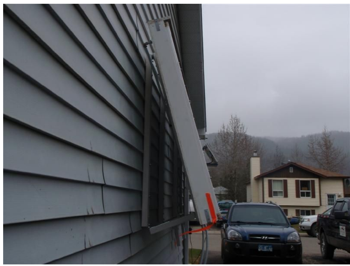
Side view showing the hinged 2 X 4 frame bolted to house

Next was plumbing the feed and drain lines. I went with \frac{3}{4} " PEX main lines, splitting into two \frac{1}{2} " lines to and from the collectors. Thinking about efficient drainback, I used tees that had one \frac{3}{4} " side and two \frac{1}{2} " ones at right angles to one another, and oriented them diagonally so that the \frac{1}{2} " lines entered the tee at a steep angle.