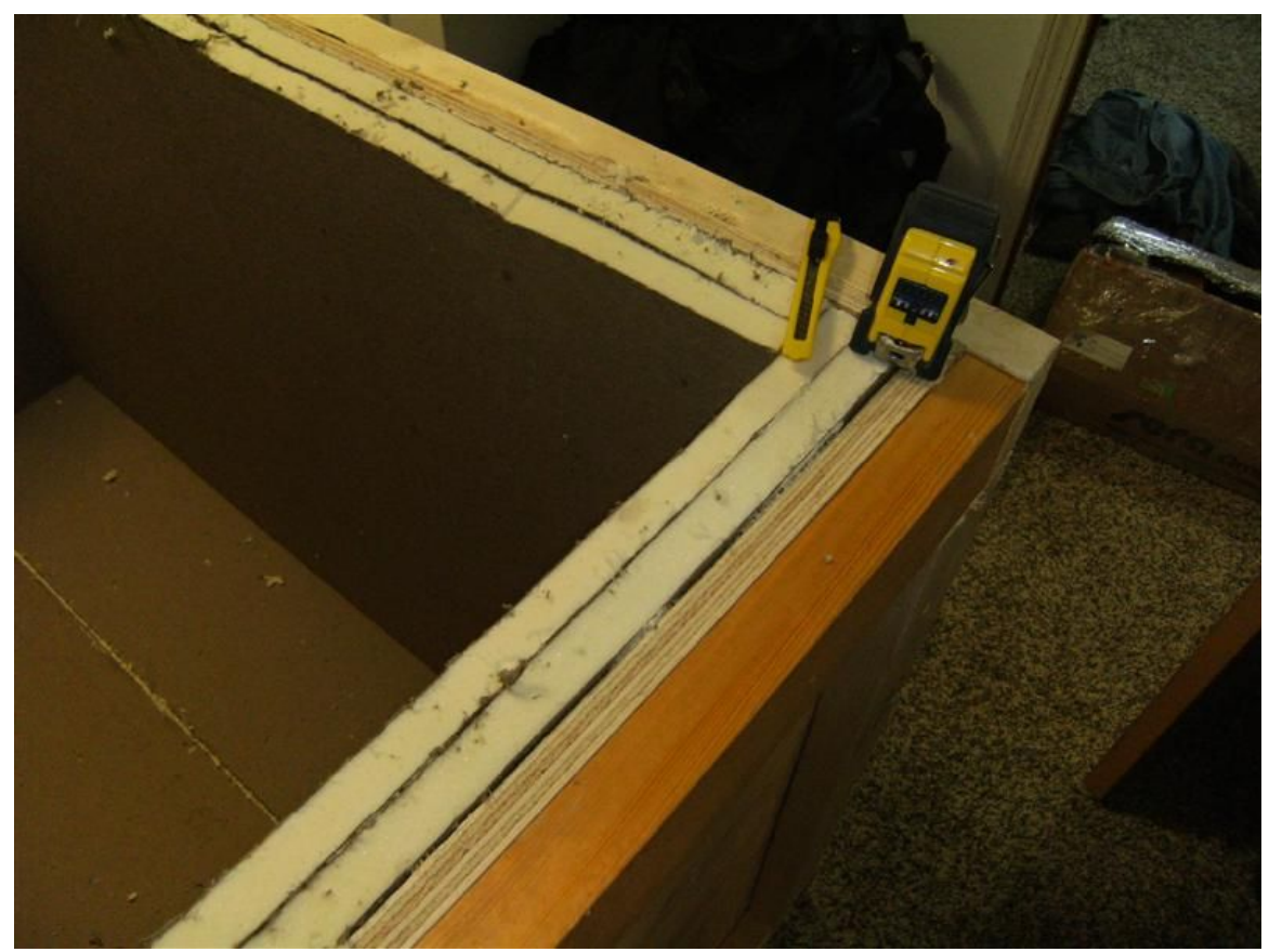
Tank detail showing 2 X 4 bracing and insulation