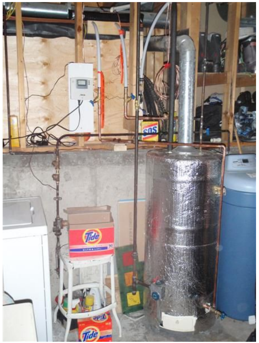
Setup with tank in background, controller, plumbing, and hot water tank