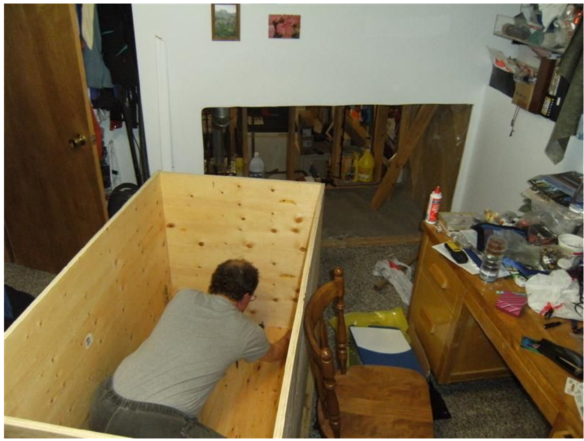
Tank construction. Note hole in drywall where tank will go through.