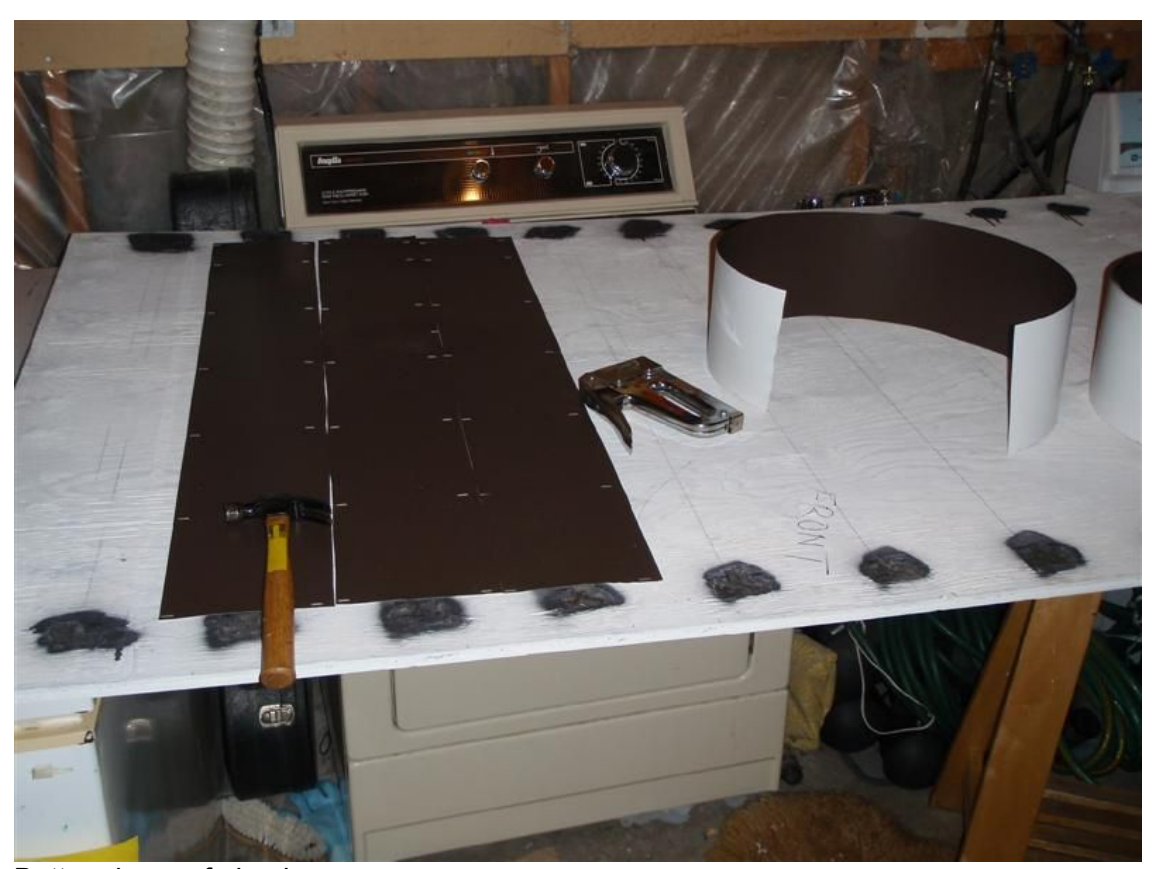
Bottom layer of aluminum

with one layer and grooved the top layer with the 5/8" rod method, placing it as tightly as I could over the copper pipe. I decided not to trim the 9" wide flashing, so with a 6" riser spacing it overlapped by a few inches. Then it was a stapling and caulking frenzy – there are almost 2000 staples in my collectors! I covered the manifolds with aluminum as well as the risers, to give maximum absorber area.