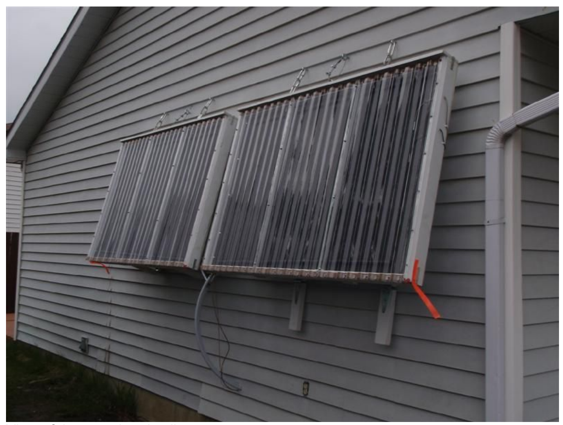
View of the completed collectors

One of the bureaucratic hurdles I had was a building permit. The town building inspector is reputed to be very strict. I didn't think I should even ask if I needed a permit, but I figured that hanging giant panels on the side of the house might be kind of obvious. So, I gritted my teeth and talked to him. He said that the collectors were no problem, but any plumbing modifications would need a $50 permit. Grumble, grumble.....The catch was that the plumbing needed to be done by a journeyman plumber certified in BC, and the further catch was that there aren't any of them in town. He finally relented and allowed a local guy who did most of the plumbing in town until this building inspector showed up (he's actually certified as a pipefitter, not a plumber) to do the work. We put the hot water line into my hot water tank at the bottom, where the drain valve is. The building inspector insisted on a double check valve on the main water line into the house, to prevent potentially contaminated tank water from messing up the town water supply if they lost pressure and my exchanger leaked and mixed tank water in.