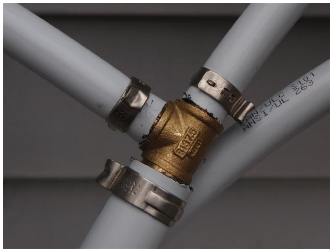
3/4" feed line splitting into two 1/2" lines, one for each collector half

Inside the house, the \frac{3}{4} " lines have a long (30 feet) run to the tank. I kept the slope at 3% as best I could. My hope is that everything outside will drain vigorously, and the lines inside the house may be more sluggish, but this won't matter since they won't freeze inside.