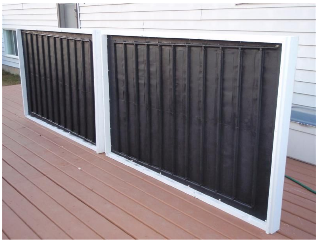
Collectors before glazing went on

Since two people could only lift these monstrosities with difficulty, and I wasn't going to go whole hog with scaffolding, I decided to use a rope system as a safety measure when lifting. I installed screw eyes into the studs on the side of the house; one for the rope and two for hanging each collector from. I put eye bolts in the frame of each collector. While my capable assistants lifted the collector, and my daughters pulled the rope, I connected the collectors to the house using quick links. Quite a production! After the rope was taken off I put 1/4" aircraft cable through the eyes for another attachment point.