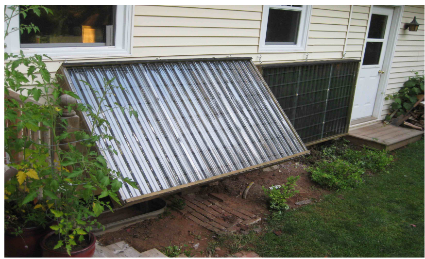
Illustration 20: The left collector is in position. One more to go.

The panels ended up weighing about 125 lbs. each...more than my back wanted to carry up the basement stairs. Thankfully, Barry and Brodie, carpenters who were working at our house, cheerfully agreed to carry them up for me. After locating the wall studs, I used 3 sets of heavy duty hooks, eyes and links to hang each collector. Two 2 X 4 pressure treated braces were used to elevate each collector to 47 degrees (i.e. slightly more vertical than horizontal). The latitude here in Cornwall, Prince Edward Island is 46.2 degrees so 47 degrees of tilt should be fine. I might have made the tilt 5 -10 degrees more vertical to help snow run off and so the collectors wouldn't protrude out so far from the house, but I had to make sure that the bottom of the collectors was high enough to allow good drain back though return lines which run through the rim joist of the house and I didn't want the tops of the collectors so high that they would block windows.