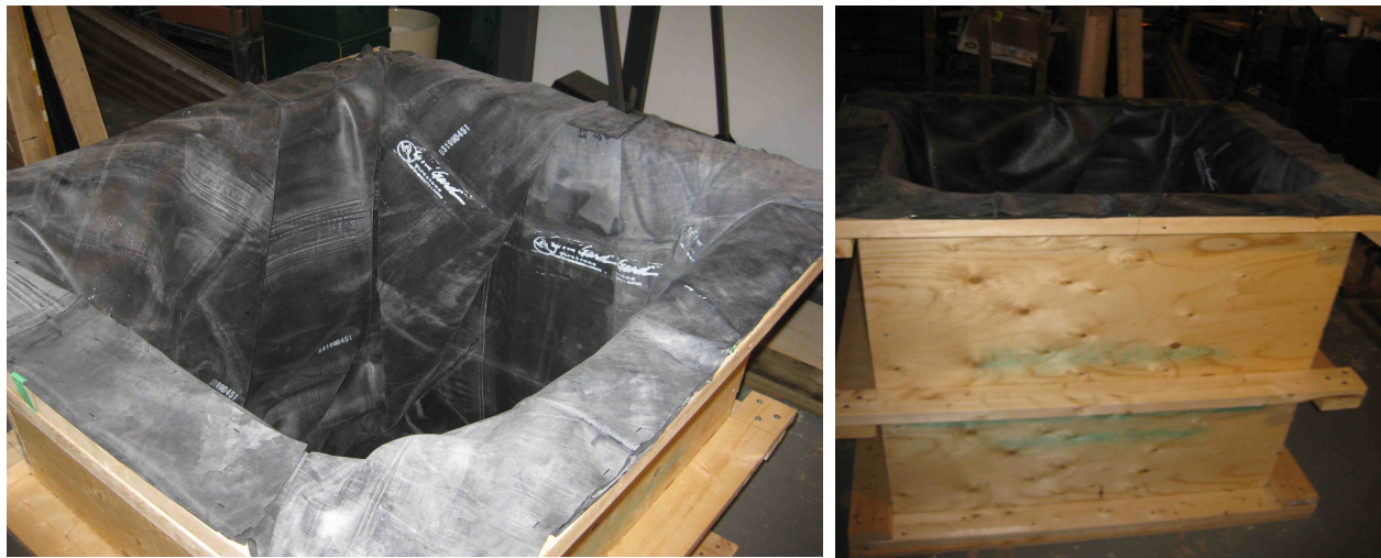
Illustration 9: Tank, showing sloppy corner tucks.

The tank is constructed of 3/4" plywood with a 2 X 4 horizontal frame members and it sits on 4" of pink polystyrene insulation board. The inside dimensions are 32 7/8" X 29 3/4" X 39" high. In addition to the top and bottom frame sections, I added a third frame section around the middle to provide added support to hold in the 1200 lbs. of tank water. Before installing the EPDM liner, the inside was sanded and silicone was applied to the corners for smoothing. It was awkward to install the liner and I didn't do a very neat job with the corner folds, but it got done.