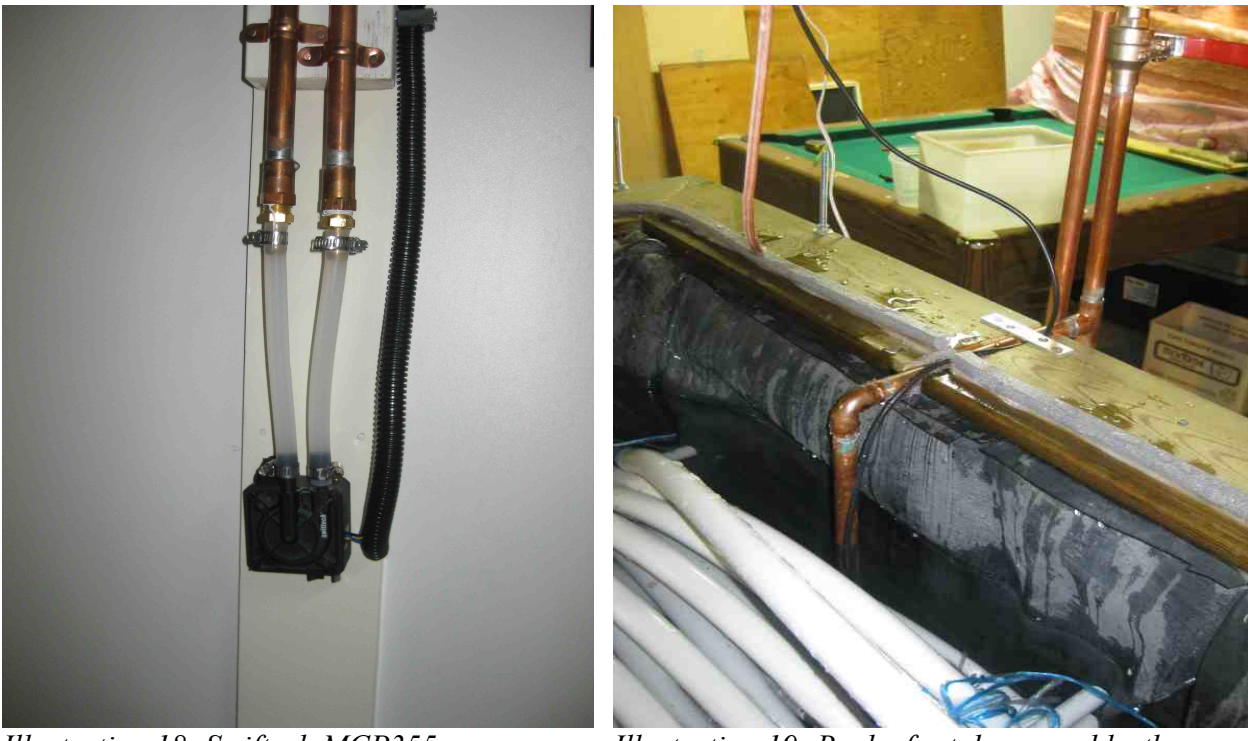
Illustration 18: Swiftech MCP355 pump uses only 18 watts and is quiet.

Heat transfer water leaves the tank through a u -tube system modeled after Gary's design. A Swiftech MCP355 pump (designed to pump water to cool computer chips) which I purchased from www.ncix.com in Vancouver (and which operates at only 18 watts of DC power) circulates the water along 26 feet of 3/4 "pex to the collectors. A Sharkbite T is used to connect the feed line to the collectors. The return line is also 3/4" pex to ensure a generous route for air to effect the drain back process.