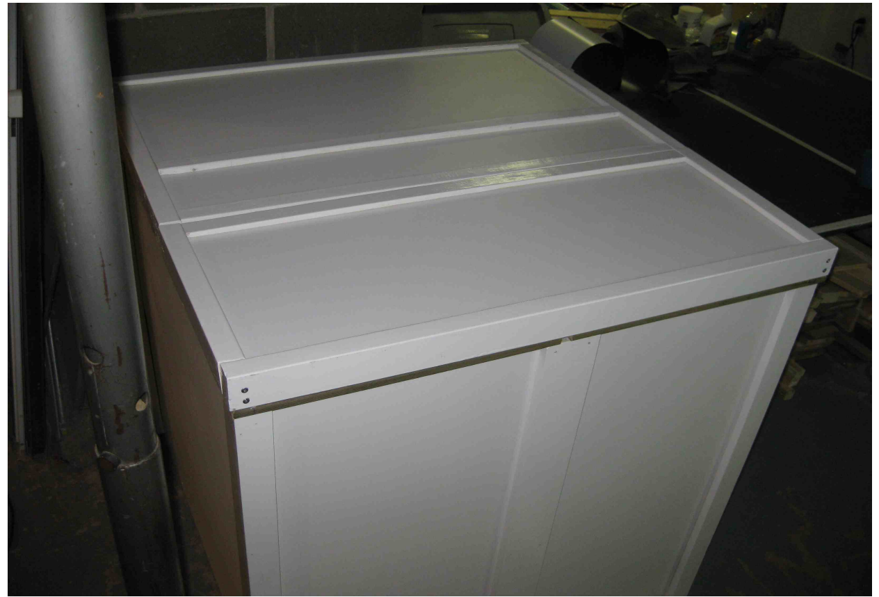
Illustration 13: The tank is starting to take shape. It resembles an oversized washing machine.

The top lids are constructed of 2 X 3 frames dadoed so that the white hardboard fits into grooves for a neater job. I glued 2" pink polystyrene insulation board to the underside of the white hardboard top. The lids are fastened with 4" bolts and wing nuts for easy removal. I siliconed a 7/16" round foam backer strip on the rim to provide a seal between the rim and cover and laid a sheet of poly over the seal (covering the entire top of the tank).