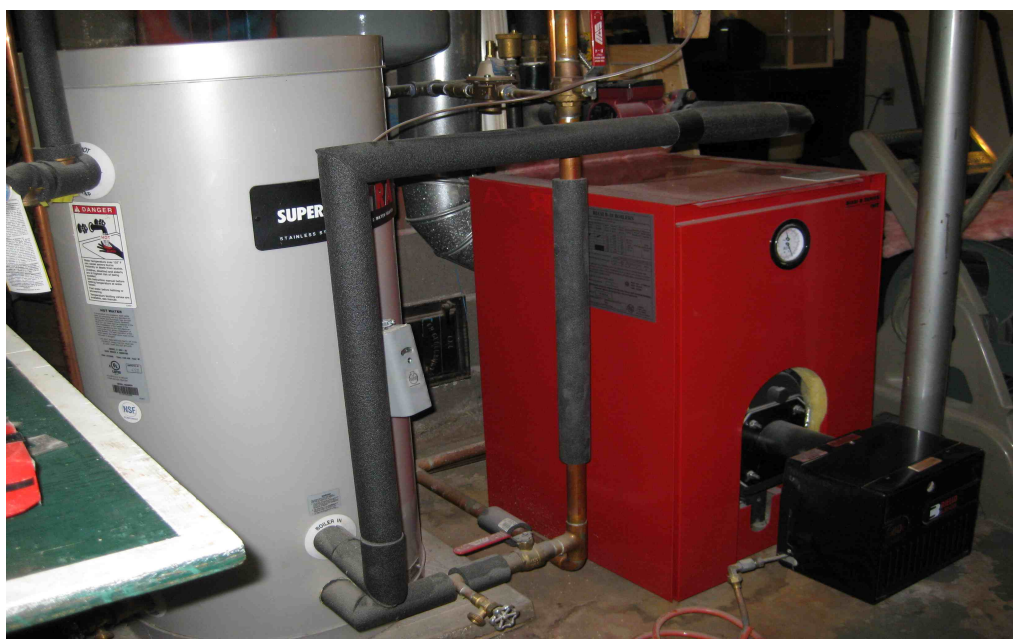
Illustration 1: The new Biasi high efficiency furnace with a Superstor Ultra indirect 30 gallon water heater cut our heating oil consumption by about 25%

A couple of years ago, motivated by the dual goals of saving money and doing my part to reduce green house gases, I decided to take some action to reduce our large annual household consumption of heating oil. Our 26 year old furnace was replaced with a new Biasi high efficiency - triple pass - cold start model with an outside temperature controller and indirect oil fired water heater.