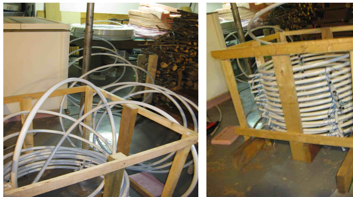
Illustration 14: Heat exchanger coiling madness.