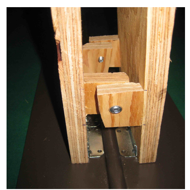
Illustration 7: Fin clamping tool in action.

I bought two 50' rolls of 9" wide painted aluminum flashing to make the absorber fins using Gary's press and sledge hammer method. The press worked fine. I also fabricated a fin vice tool modeled after his. This worked reasonably well, although I should have used stronger metal teeth in it. Since the aluminum was on the thin side, I laid a 3 inch strip under the copper pipe grid to improve heat transfer.