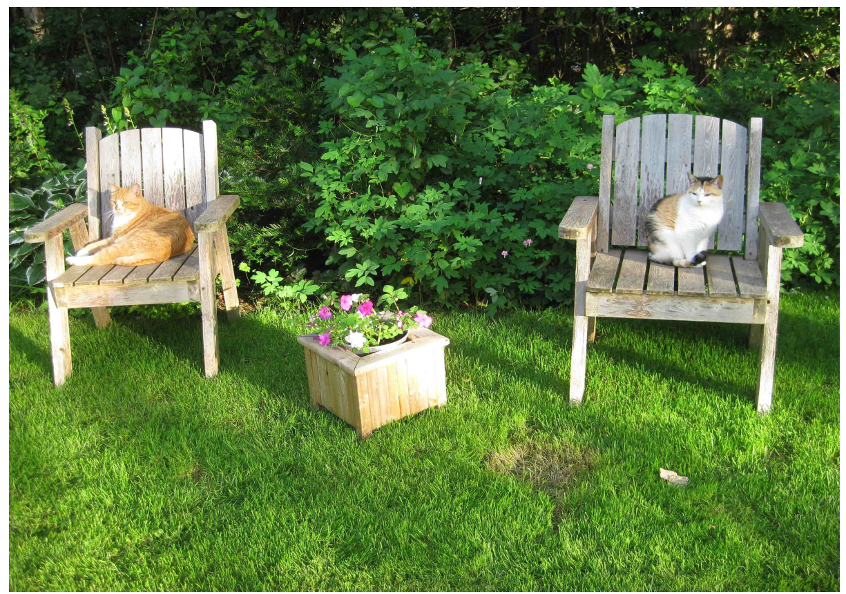
Illustration 24: Yogurt and Cali leisurely watching the collectors harvesting sun.

The collectors reach 180 F degrees around solar noon hour on a sunny day and this generates rapid heat gain. My rough calculations (I'm not an engineer) show that the system harvests 1200 watts of power when the system is running, about the same power output as an electric kettle.