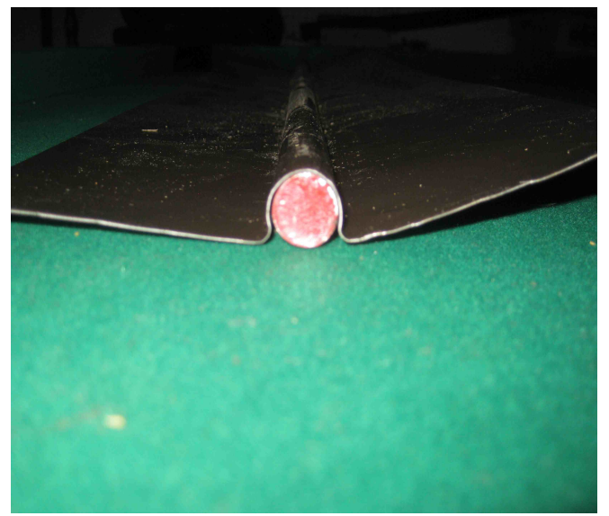
Illustration 6: A newly minted fin showing good contact.