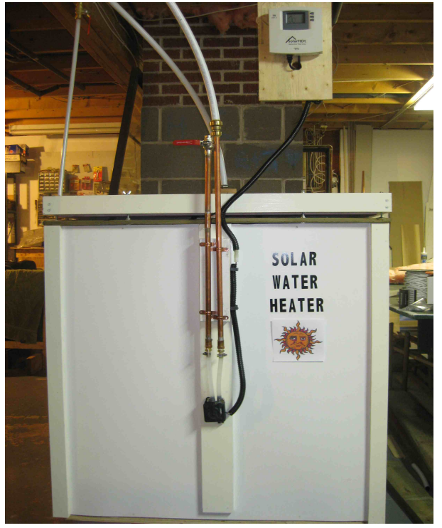
Illustration 23: The tank and controls. Note the feed and return lines to the tank.