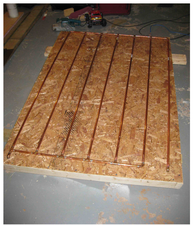
Illustration 5: This shows the layout of the tubes on the left collector. The top is on the right side of the photo.

I bought two 50' rolls of 9" wide painted aluminum flashing to make the absorber fins using Gary's press and sledge hammer method. The press worked fine. I also fabricated a fin vice tool modeled after his. This worked reasonably well, although I should have used stronger metal teeth in it. Since the aluminum was on the thin side, I laid a 3 inch strip under the copper pipe grid to improve heat transfer.