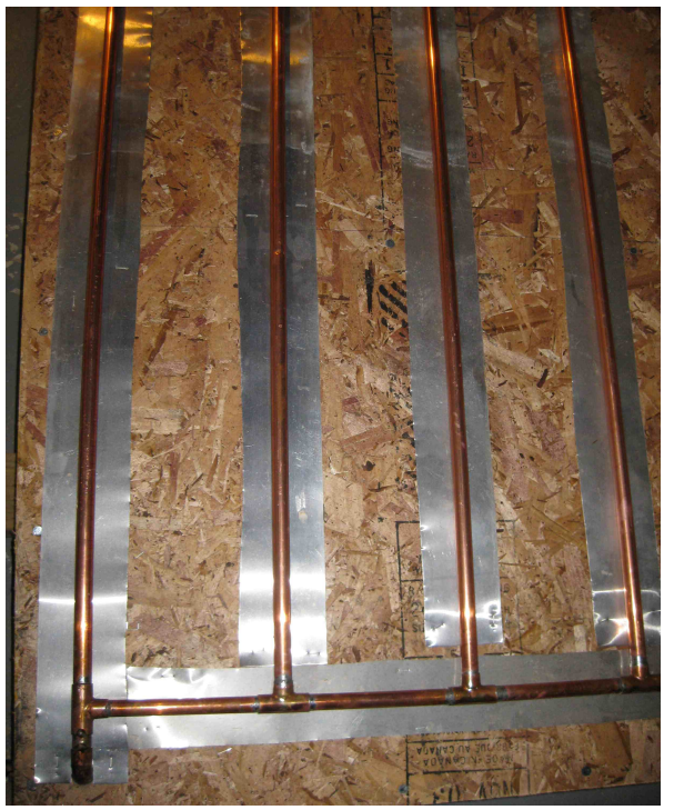
Illustration 4: Three inch strips of aluminum under the copper grid. The strips were painted to avoid galvanic corrosion.