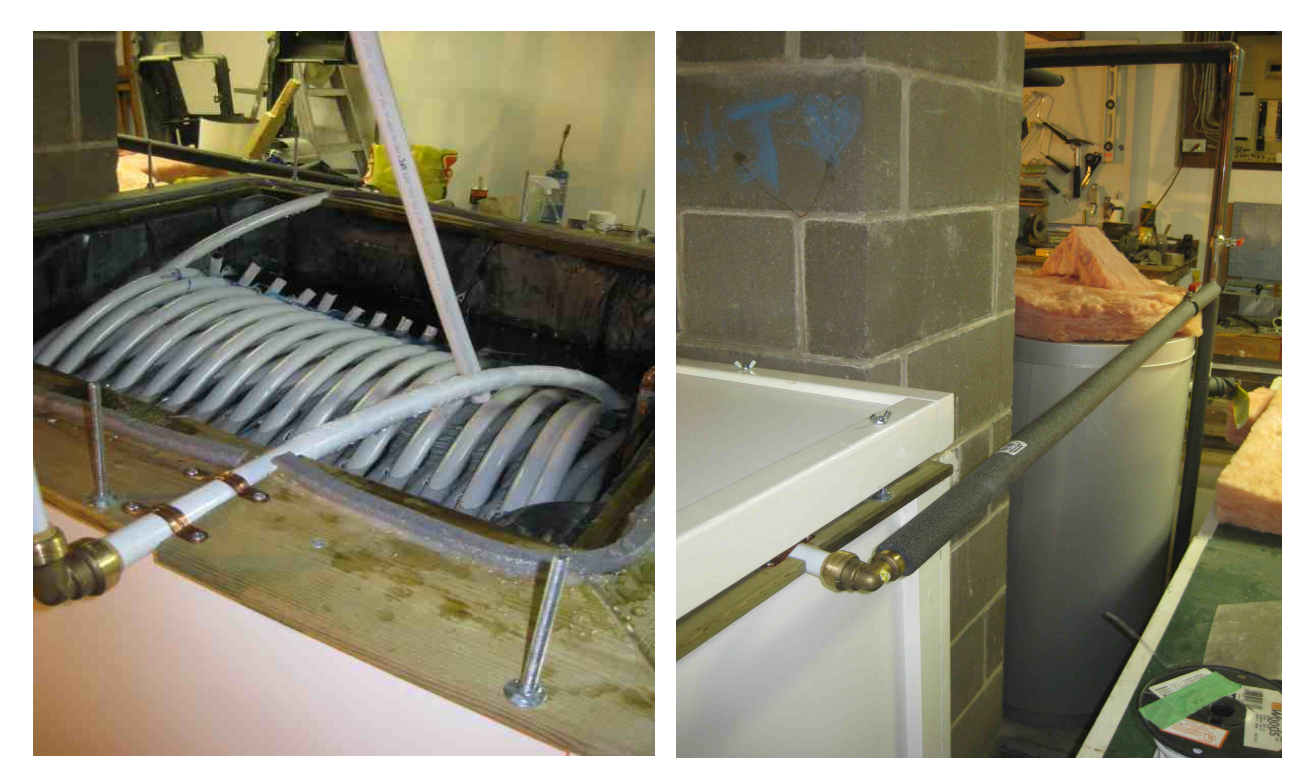
Illustration 16: Heat exchanger in tank. Inlet pipe is foreground.

The outlet end of the exchanger travels via a 5' length of 1/2" copper tube to a 30 gallon indirect oil fired water heater. I installed three gate valves in the water supply so the solar water heater can be bypassed if servicing etc. is needed.