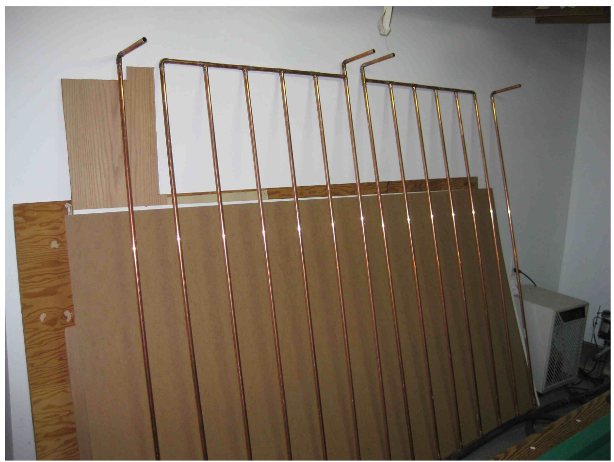
Illustration 3: Copper grids soldered and awaiting placement on the collector panels

In the end, I decided on two 4' x 6' collectors, each with 7 copper tubes running horizontally and the headers oriented vertically. This allowed for efficient use of 6' copper tubes (I cut 6" from each one to use as the header pieces) and 12' sections of polycarbonate glazing (which were cut into three equal sections). It was a lot of work to cut all the copper tubes and sand them, but the actual soldering process went quickly and worked well (though not perfectly as I later found out).