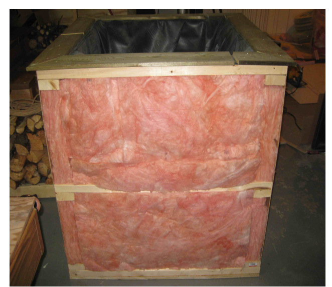
Illustration 11: R-12 fiberglass batt insulation.

I couldn't locate plastic decking planks to place over the edges of the EPDM on the rim, so I used 1" X 6" pressure treated lumber. Time will tell how long this will last in the tank's humid environment. I used 3.5 " fiberglass batts for insulation on the sides and covered these with 1/8" hardboard that comes pre-painted white. I used some pine for trim.