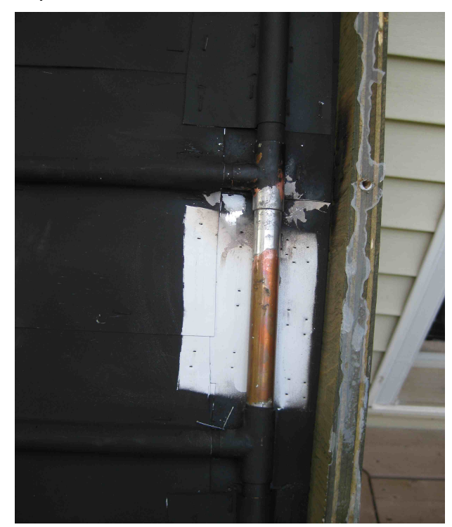
Illustration 22: The leak site after soldering. It held!

I reluctantly unscrewed the fasteners holding the polycarbonate glazing on the right side and bottom of the right collector and after carefully sanding and generously fluxing the site of the leak, I carefully applied the blow torch and lavish amounts of solder. Luckily I didn't set the collector on fire and the repair worked. System heating performance improved thereafter and I have had no other problems in the first month of operation.