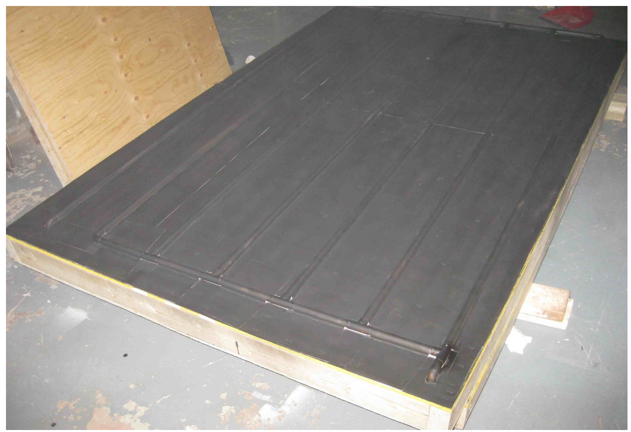
Illustration 8: The right collector after application of barbecue paint. The outside frame goes on next.

After all the fins were stapled down, the collectors were spray painted with flat barbecue paint. I cut 2' X 12' sheets of Suntuf polycarbonate glazing into 3 sections and affixed them with the use of wiggle strips on the top and bottom and silicone and metal roof screws on the sides. 1" square wooden strips screwed on the top and bottom ensure consistent pressure along the length of the wiggle strips.