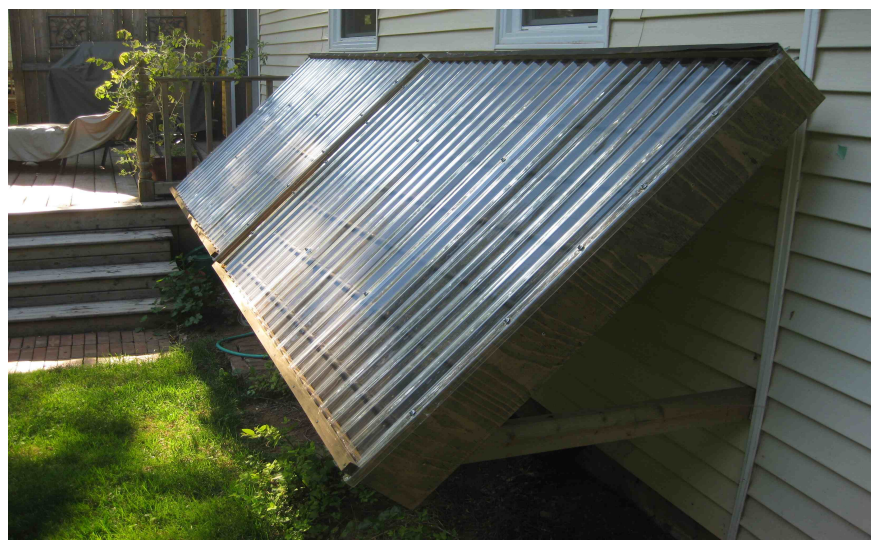
Illustration 21: Collectors in position and ready for sun.