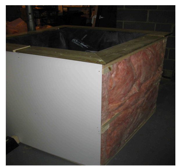
Illustration 12: Hardboard being applied