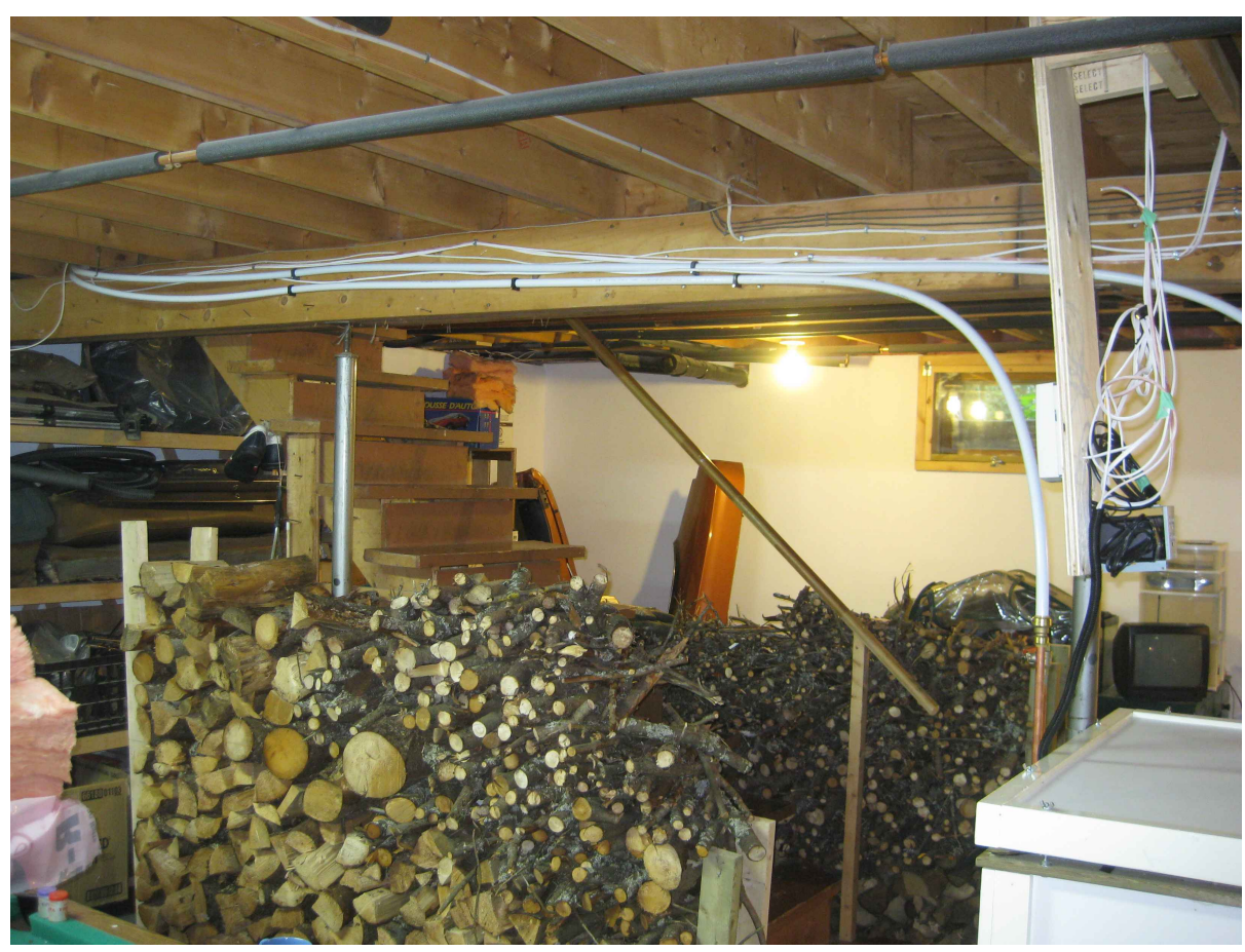
Illustration 5: View of feed and return lines. Fenders from a 72 Olds Cutlass (another project) in the background.