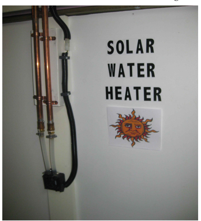
Illustration 4: Close up of sun face icon and wiring loom (corrugated plastic auto wiring loom).