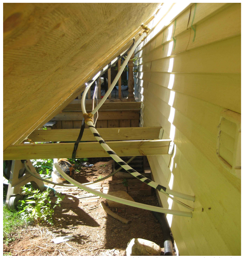
Illustration 1: Return line is visible. Electric tape holds the sensor wires against the lines