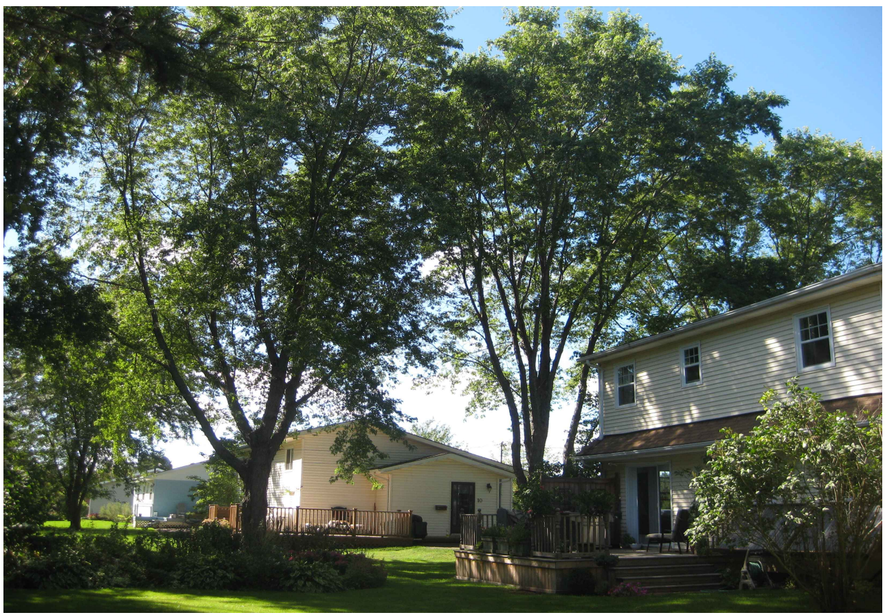
Illustration 3: Another view of tree shading. Photo taken about 3-4 pm. These trees are beautiful, but they are too large and too close to my and my neighbour's houses should they come down in a windstorm. The collectors are hidden behind the lilac bush lower right.