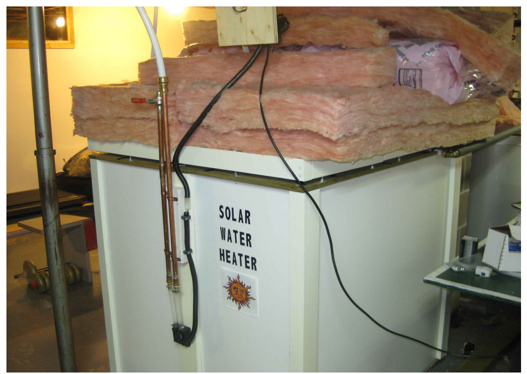
Illustration 6: I decided to store the unused fiberglass batts on the tank....this should increase the R-value of the lid!