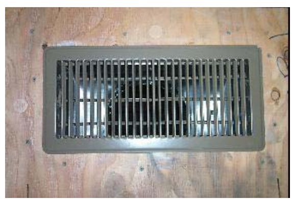
Figure 5. Example supply grille of multi-branch duct system in LBNL laboratory