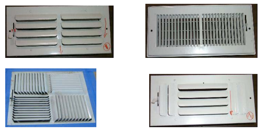
Figure 4. Examples of grilles used for single-branch calibration test apparatus. Clockwise from top left: one-way, two-way, three-way, and four-way throws.