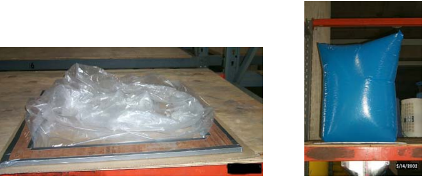
Figure 2. A clear bag before a measurement and a blue bag at the end of a measurement