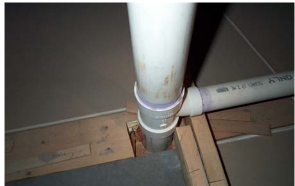
Figure 2 Large gaps around pipes, such as around this sewer vent where it penetrates the attic, should be sealed first by cutting and fitting pieces of scrap wood snugly around the pipe, and then filling in the gap with insulating foam.