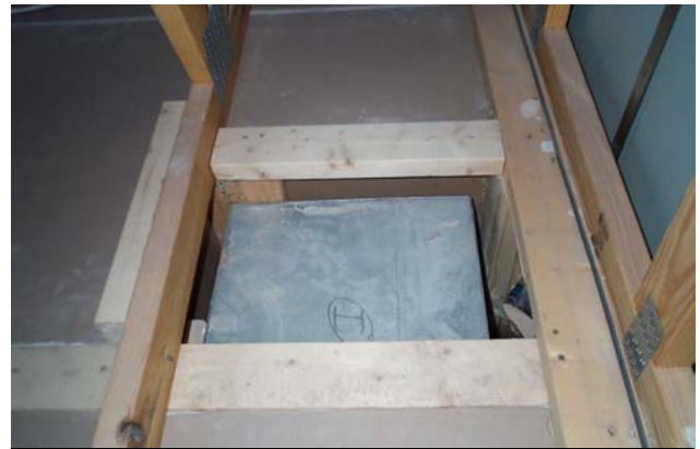
Figure 3 This open chase for the return duct to the furnace creates a major air leak into the attic. It must be sealed with a piece of drywall or wood.